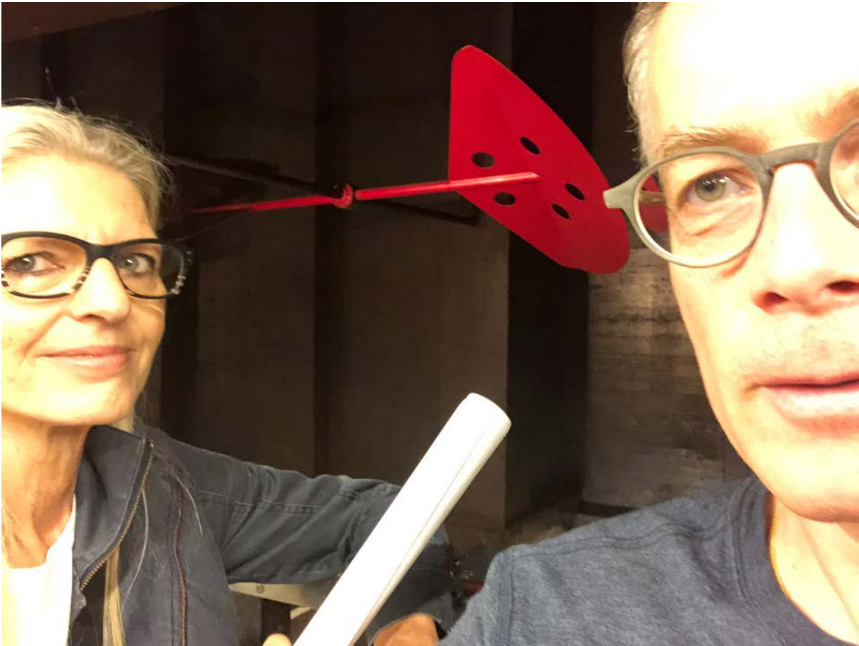
September 2019